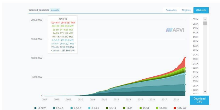
Figure Caption: Strong growth in utility scales solar is shown in red. Commercial rooftop installs are typically 10kW to 100kW (shades of green) while residential rooftop is typically less than 10kW, shown in shades of blue. http://pv-map.apvi.org.au/postcode

September data from the Australian Photovoltaic Institute ( APVI ) and Clean Energy Regulator ( CER ) shows accelerated growth in utility scale solar, particularly benefiting rural and regional Australia.